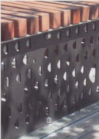
Resene Blast Grey 3