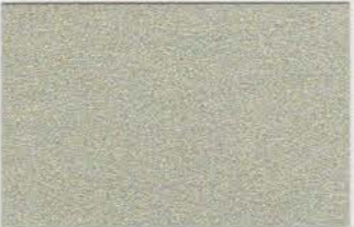
Stun™ (Coriander) M78-034-108